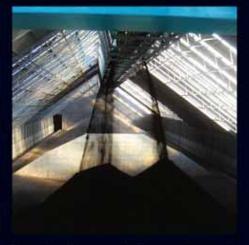
The total area of the terminal is 25 hectares, the terminal has a well developed infrastructure and a safety system that meets the ISPS code. The terminal has been certified to be in conformance with the ISO 9001:2008 quality management system.